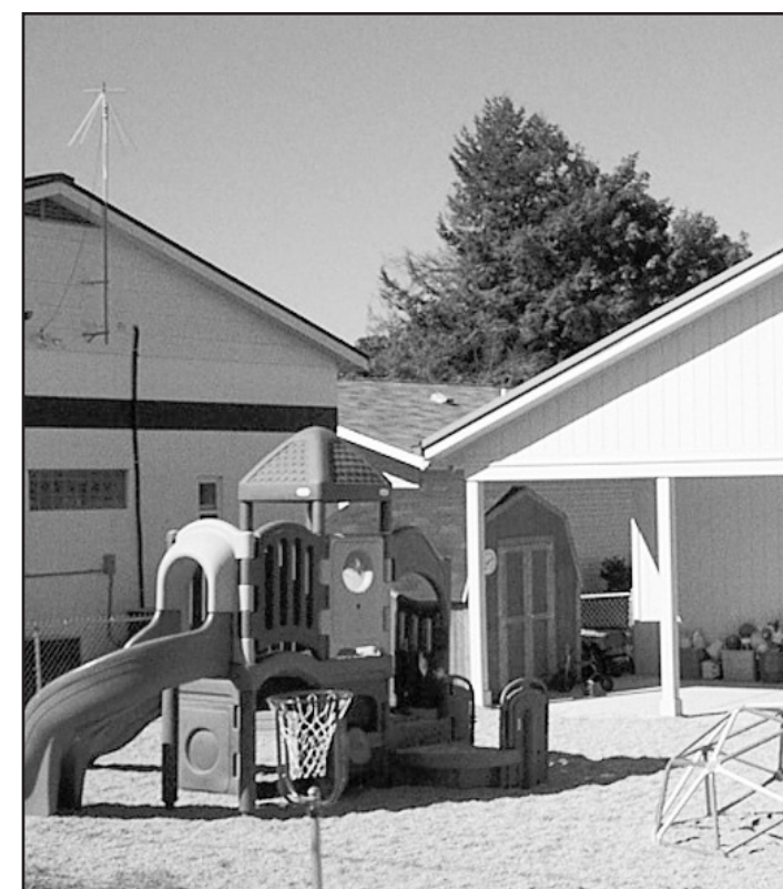
Laurelville Head Start is one of six child-care facilities run by Hocking Athens Perry Community Action. The other five Head Start programs are in Athens, Corning, Logan, Nelsonville and New Lexington.

• In 2009, we served 1,057 children through the Head Start program.