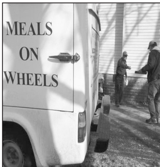
Meals on Wheels delivered 65,609 meals to homebound elderly in Athens and Hocking County last year.

• Once a month, supplemental food is delivered to 4,250 income-eligible citizens 60 years or older in the 10-county region served by the Community Action Regional Food Center.